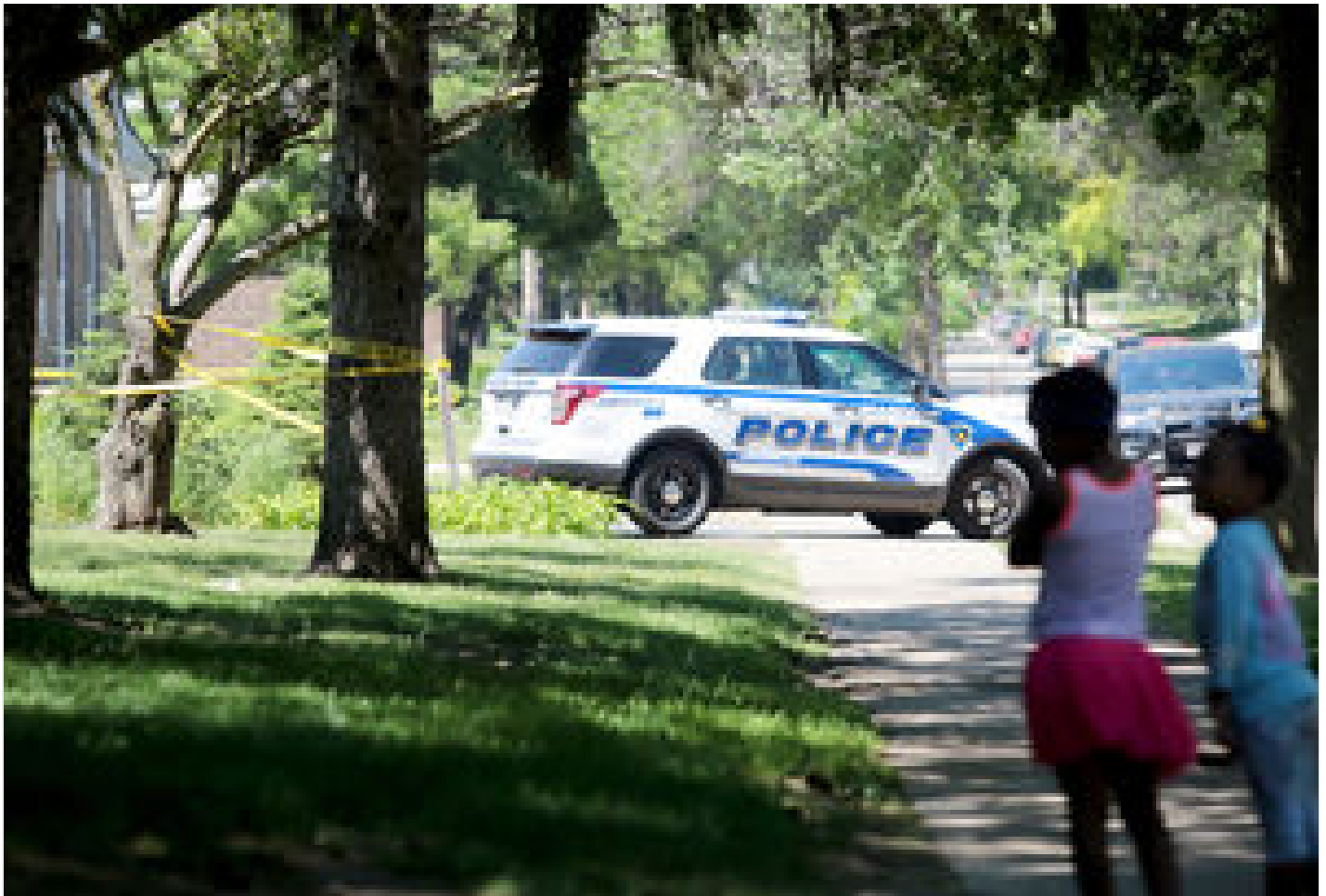
Man dies after being shot on Far East Side